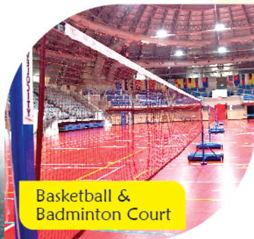
Basketball & Badminton Court