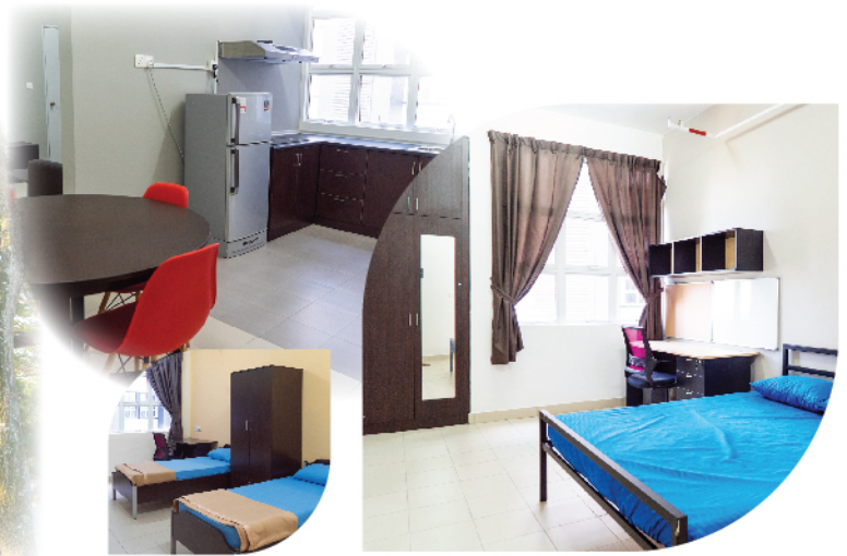
All pictures shown are for illustration purpose only