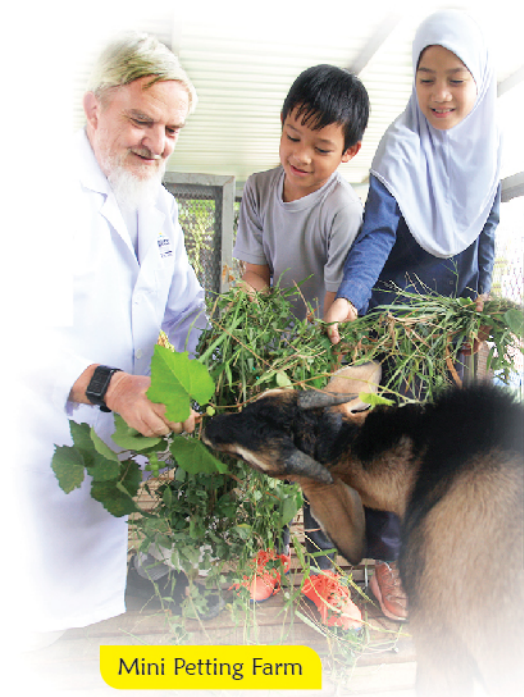
Mini Petting Farm