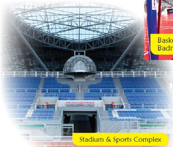
Stadium & Sports Complex

We endeavour to let students showcase their best athletic interests and skills. In EduCity Iskandar Puteri, top-notch recreational and sporting facilities are provided.